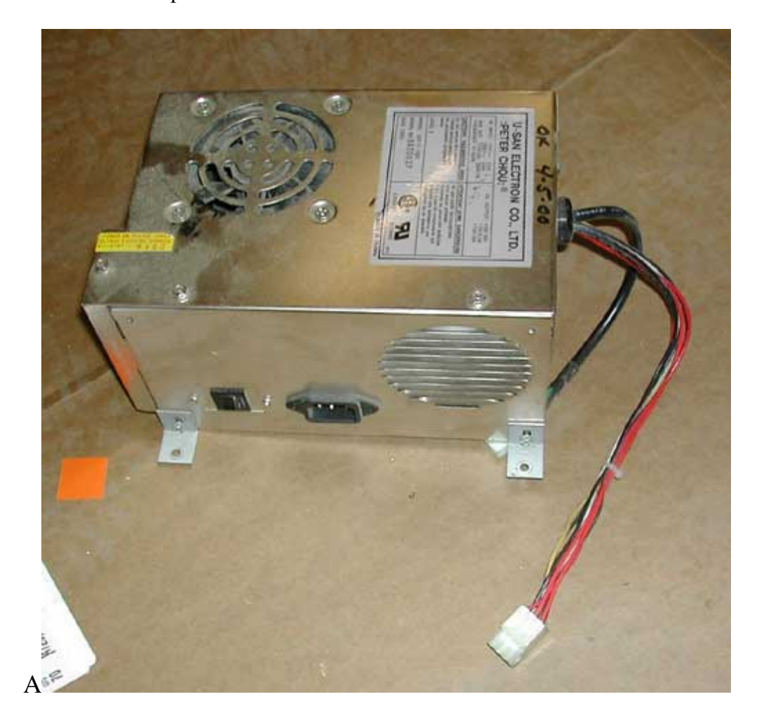
The DC output connector is a 9 pin Molex.

Fan is an 80mm square 12 VDC type. You can use Radio Shack # 273-243 or Jameco # 16993CH as a replacement.